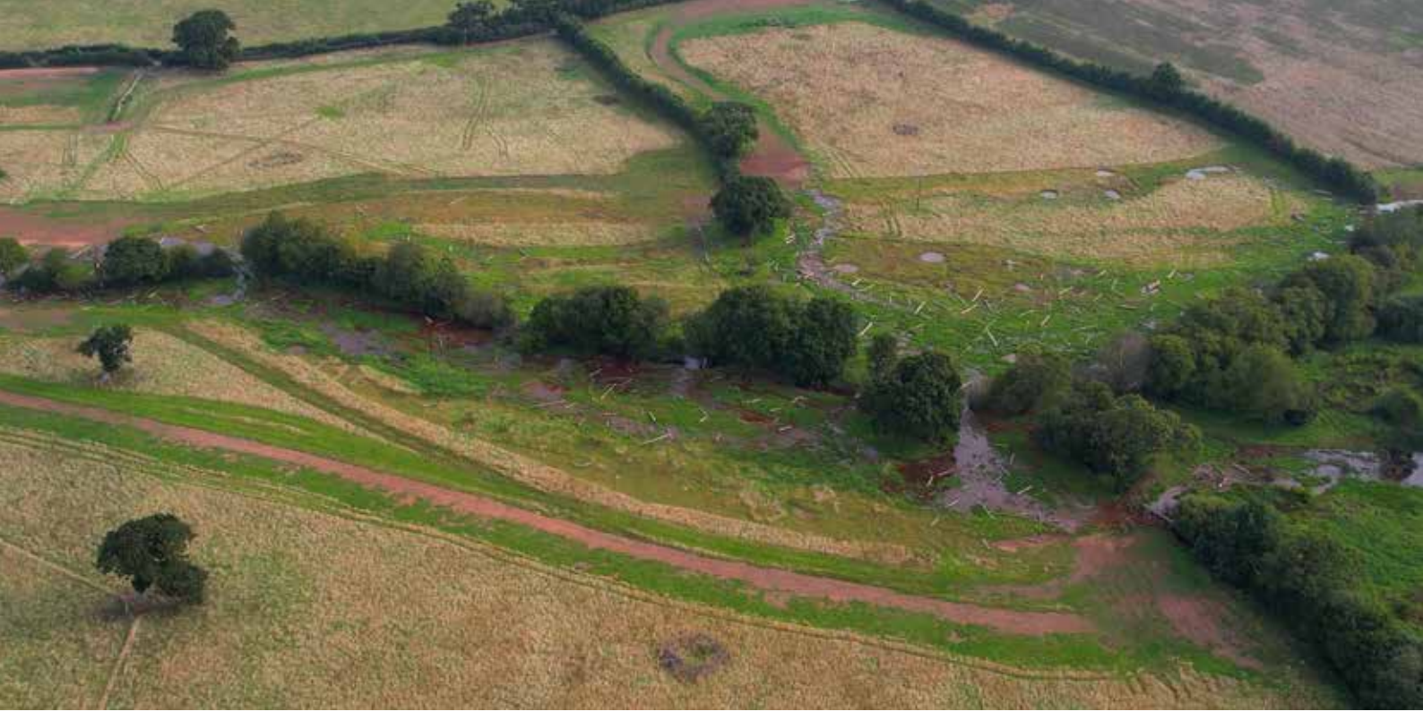
River Aller works