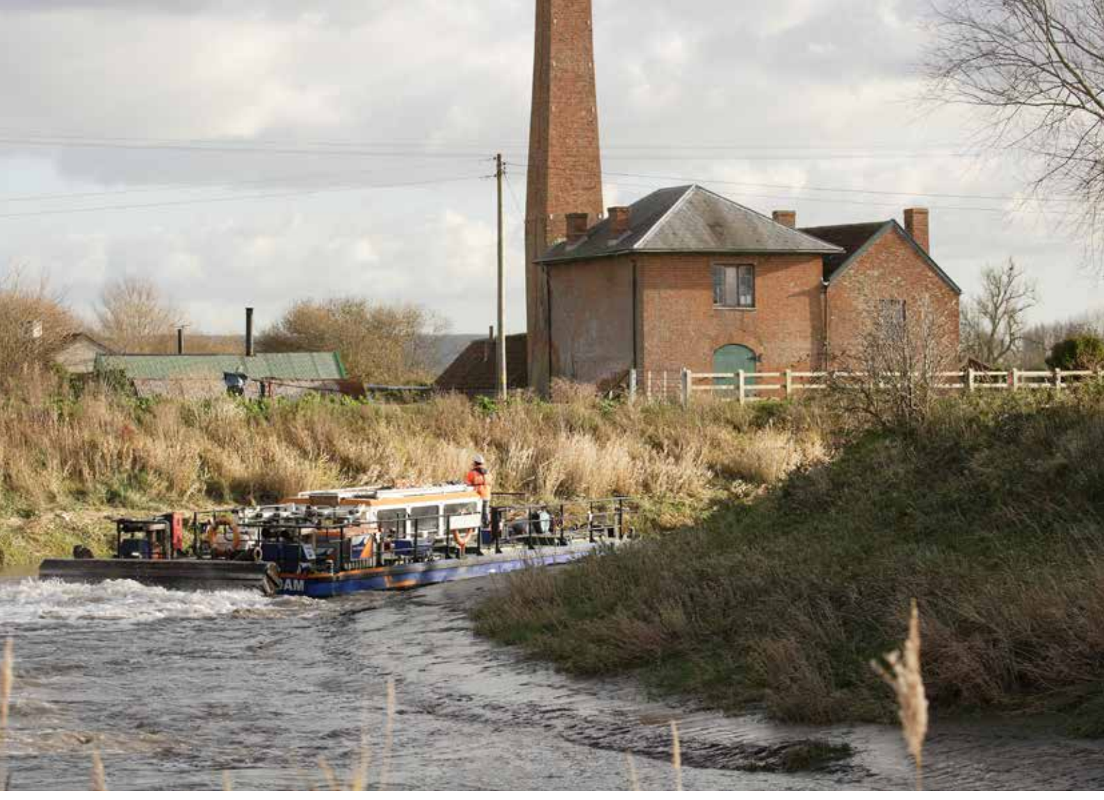
Water injection dredging