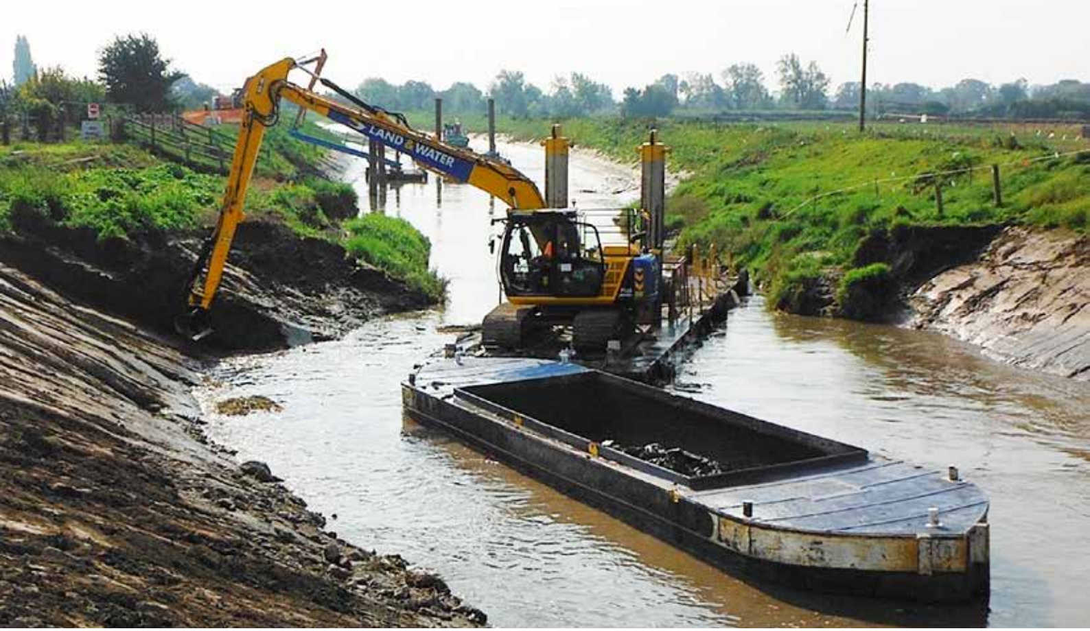
Dredging in 2014