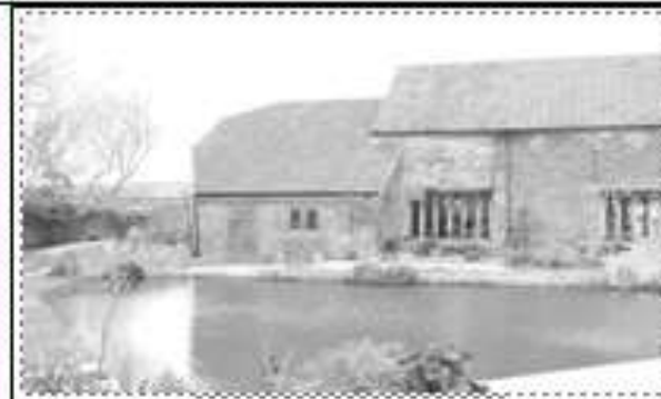
Gurney Manor Mill

All persons using these walks do so at their own risk and are advised that some areas may be muddy. Please remember to close any gates encountered on the walk. Dog owners are reminded that this walk crosses farmer's land. There may be animals either on this land or in adjacent fields. Please ensure that dogs are kept on a lead at all times. Also be aware that it is a fineable offence not to clear up should your dog foul the area.