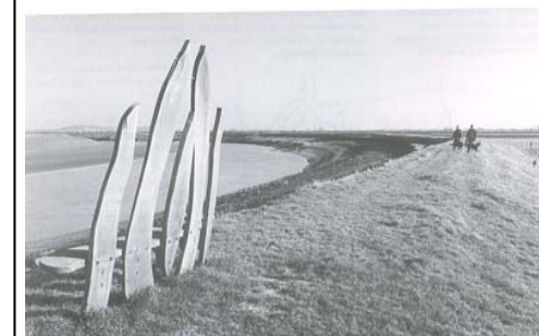
Ebb & Flow Sculpture

*** This walk is just over 5 miles and takes up to three hours. However at this point instead of continuing to Combwich you can return to Cannington directly along the Hinkley Point Road. This reduces the walk to 3 miles. (Care should be taken along this busy road)