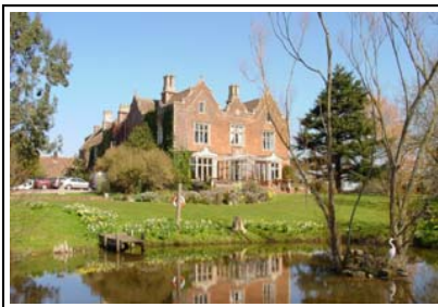
THE GRANGE CANNINGTON

Cannington has a number of nature walks all of which provide interesting viewing areas of the countryside and/or historic backgrounds.