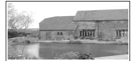
Gurney Manor Mill

All persons using these walks do so at their own risk and are advised that some areas may be muddy. Please remember to close any gates encountered on the walk. Dog owners are reminded that this walk crosses farmer's land and may have animals either on this land or in adjacent fields. Please ensure that dogs are kept on a lead at all times. Also be aware that it is a fineable offence not to clear up should the dog foul the area.